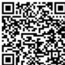
Link to this flyer

Juniors, if you join for this class your membership runs through Dec. 2025 (2 months free) Junior members have full club privileges to all venues. May participate in junior archery, pistol, rifle and shotgun programs.