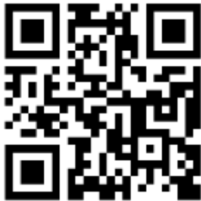
DSC website link for additional event photos

To that end we are in need of some equipment the club does not currently possess. Specifically, we are looking for a number of Ruger 10/22 rifles and Mark Series 22 pistols. Additional items needed are red dot sights for the rifles and magazines. We need a minimum of five magazine per rifle or pistol. These items do not have to be new, just functional. So, if you have one taking up room in the gun safe, this may be the best way to make room for another gun. If you would like to donate any of the above items or cash toward there purchase, please contact the office or drop them off at the clubhouse. Firearms must go to the office and be prearranged before drop off.